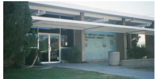
1970 Photo of Chatsworth Branch Library built in 1963

From 1952-1963 the Chatsworth community was serviced by the LA Public Library Bookmobile Program. The bookmobile made scheduled stops throughout the valley, stopping here across the street from the Chatsworth Park Elementary School.