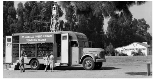
1952 Photo of Bookmobile located in Chatsworth, note Chatsworth Women's Club building in background on Topanga.

From 1952-1963 the Chatsworth community was serviced by the LA Public Library Bookmobile Program. The bookmobile made scheduled stops throughout the valley, stopping here across the street from the Chatsworth Park Elementary School.