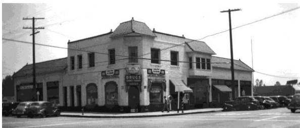
1949 Photo of Chrysler Building, library would have been on the left facing Devonshire in about 1950.