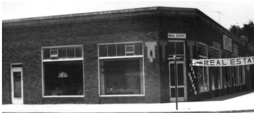
1947 Photo of the Lombardi Building with LA Public Library sign in the window on the left.

In 1947 Eileen Janess photographed many of our local streets and businesses. One of those photos shows a LA Public Library sign in the Lombardi Building at the southwest corner of Owensmouth and Devonshire, on Owensmouth. The building was a brick structure that housed a variety of business through the years, including an Auto Parts, Feed Store and the 5 & 10 cent store. It has since been demolished. Although no records of the library have been located, the photos clearly show that this early branch existed in one of the storefronts in 1947.