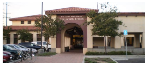
2009 Chatsworth Branch Library parking lot entrance

In 1998 funds were approved for adjacent land and an expanded building on the existing site. In June 2002, ground breaking began for the new building while a temporary library was opened at the Chatsworth Train Station that housed a small portion of books while allowing local patrons easy access to the LA City library system.