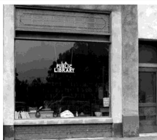
1950 Photo of Chatsworth Station Branch

This same LA PUBIC LIBRARY sign is later found in the 1950 photo shown below provided by the LA Public Library archives and listed as the Chatsworth Station Branch. This photo is clearly a different storefront, and appears to be the Chrysler Building, once located on the south east corner of Devonshire and Topanga. The features above the windows correspond to that building at the time. The location was on Devonshire, before the hardware store moved to that section of the building.